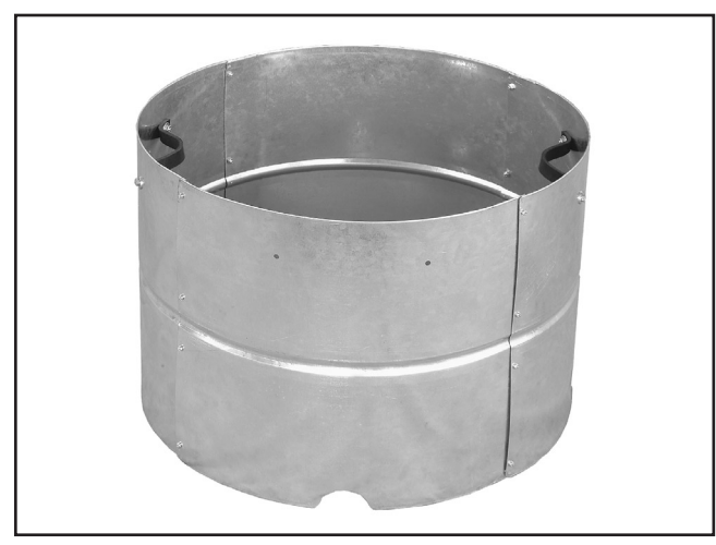
Figure 1. Model H8173 assembled.

If you need help with your new bag holder, call our Tech Support at: (570) 546-9663.